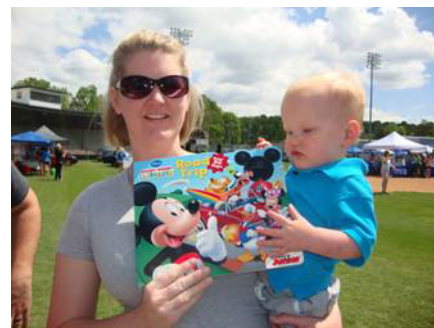
A Place to Grow Spring Fling-May 21, 2016