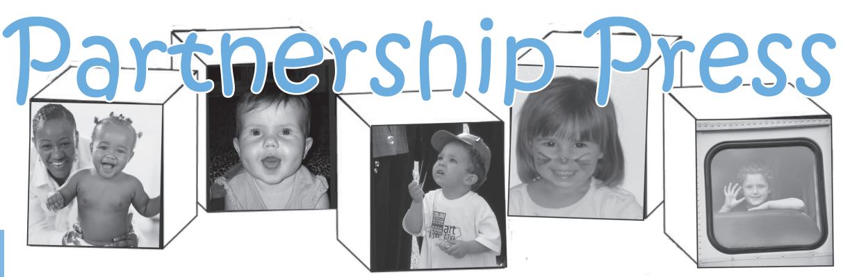
News and Info about Smart Start in Lincoln & Gaston Counties